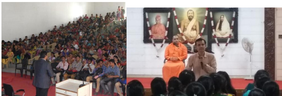
Soft skill training

Soft skill development improves relationship with the people. An engineer is supposed to be complete only with adequate soft skills. This will finally determine the level of success.