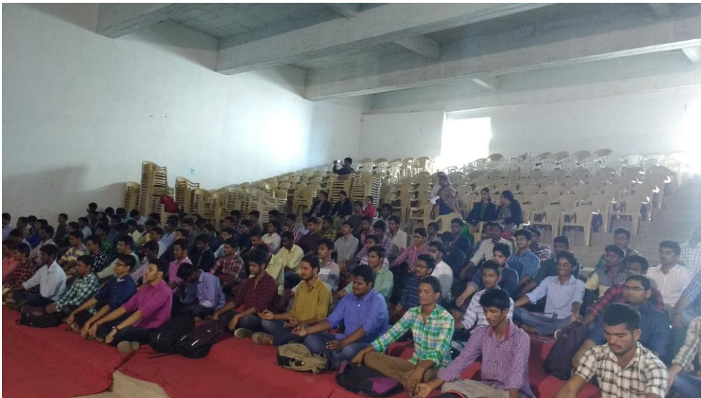
Yoga and Meditation