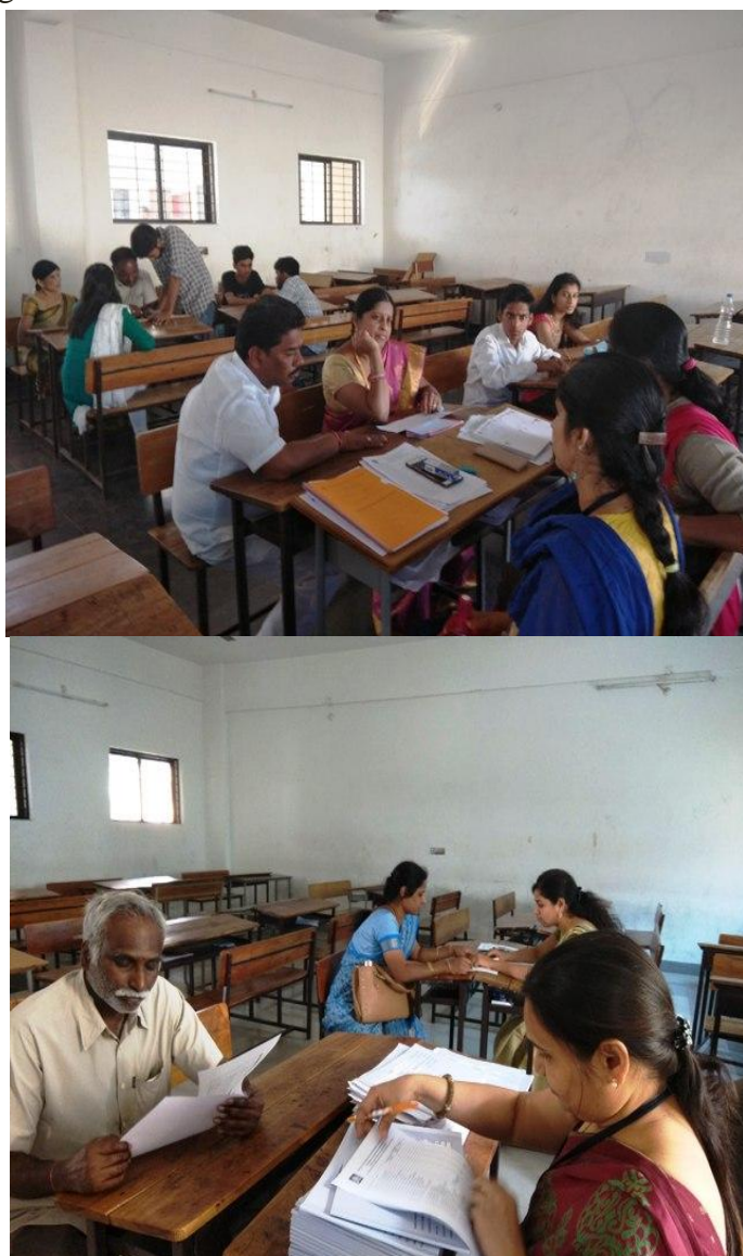
Student-Parents counselling by mentor

Every 20 students are provided with a counselor (Mentor) who maintains a close rapport with them, so that they feel free to share their personal problems. Personal counseling in this college is confidential and allows the students to explore their concerns like, difficulty in concentration on studies, stress, depression, demotivation etc.,. These sessions provide an opportunity to the students for better understanding of themselves and others, set personal goals and improve towards desired change.